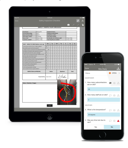
Figure 2. Oracle Aconex Field