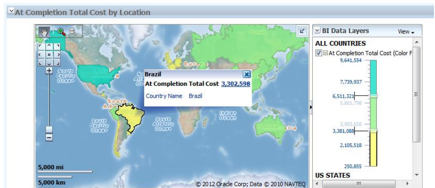
Figure 3. Geospatial maps allow project, cost, business process, resource and activity metrics to be visualized by geographic location with full drilldown capabilities.

Primavera Analytics will give your entire organization a single BI solution where published project performance indicators, trends, statistics, graphs and geospatial maps are available through a self-service portal. With the flexibility of the Oracle BI engine, you can combine your project data from your instances of Primavera Unifier and Primavera P6 EPPM with information from your ERP systems, financial data, or customer data to create a single view of the truth across the enterprise. This provides an increased level of transparency and visibility into your business processes and project performance that are required to maximize efficiencies and return on investment.